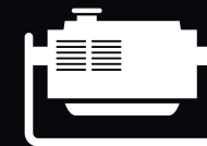
Portable Fuel Fired Generator